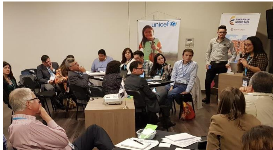
Sector strengthening and knowledge sharing