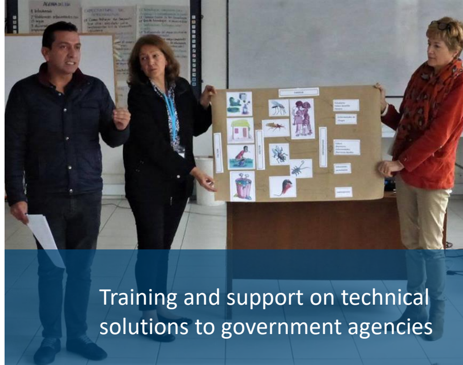
Training and support on technical solutions to government agencies