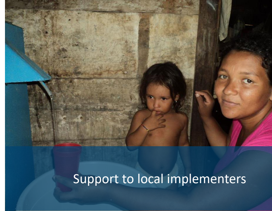
Support to local implementers